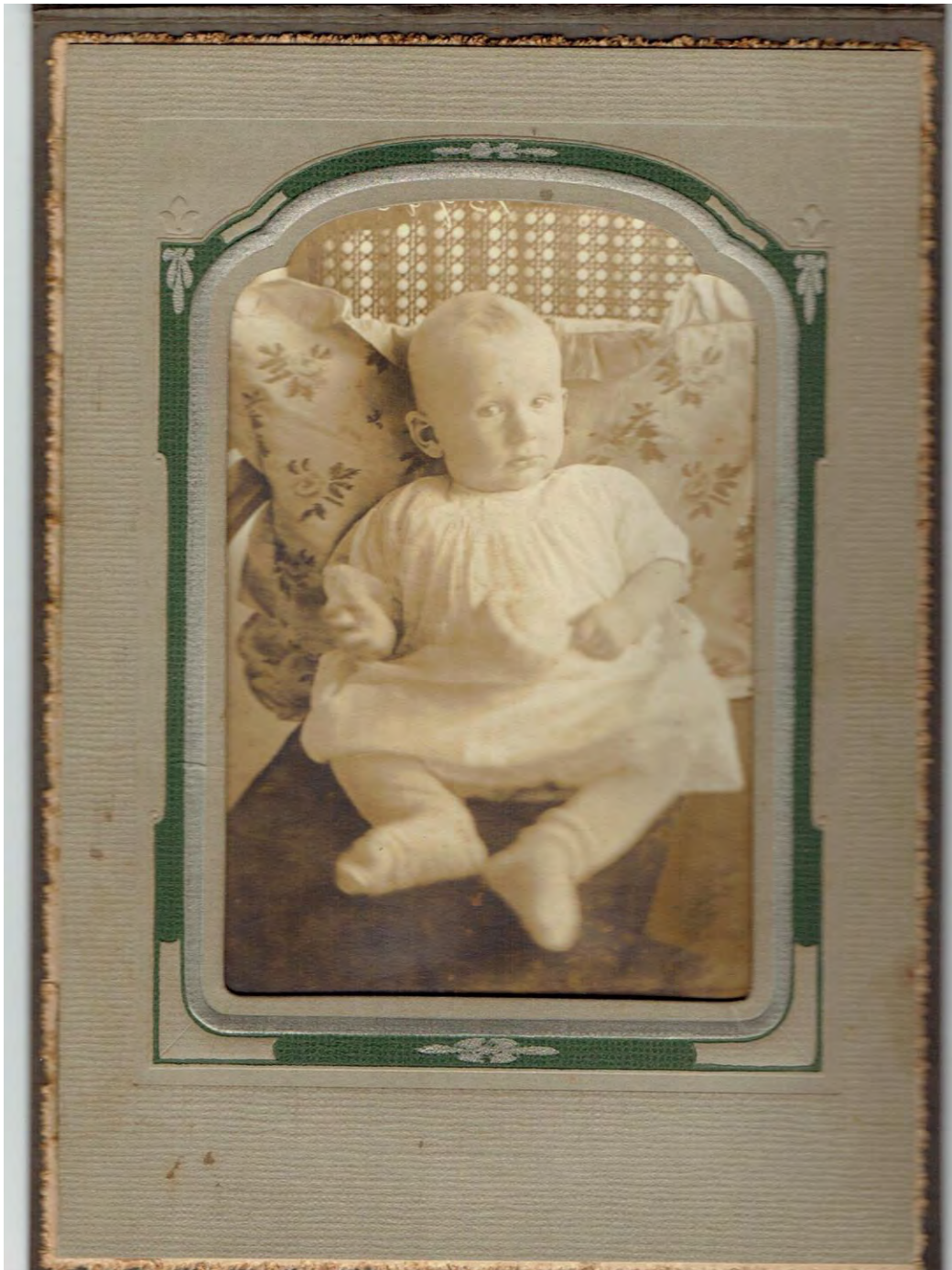
ph0973 Jack Moore 38-39cfa.