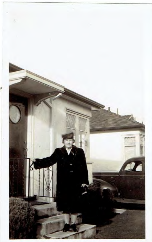
ph0968.2 wife of Fred Moore 38-39cb.Sp. (likely)