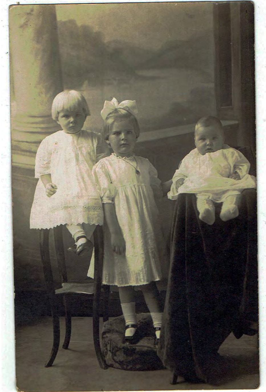
ph0974 Mennie Group2 unidentified children