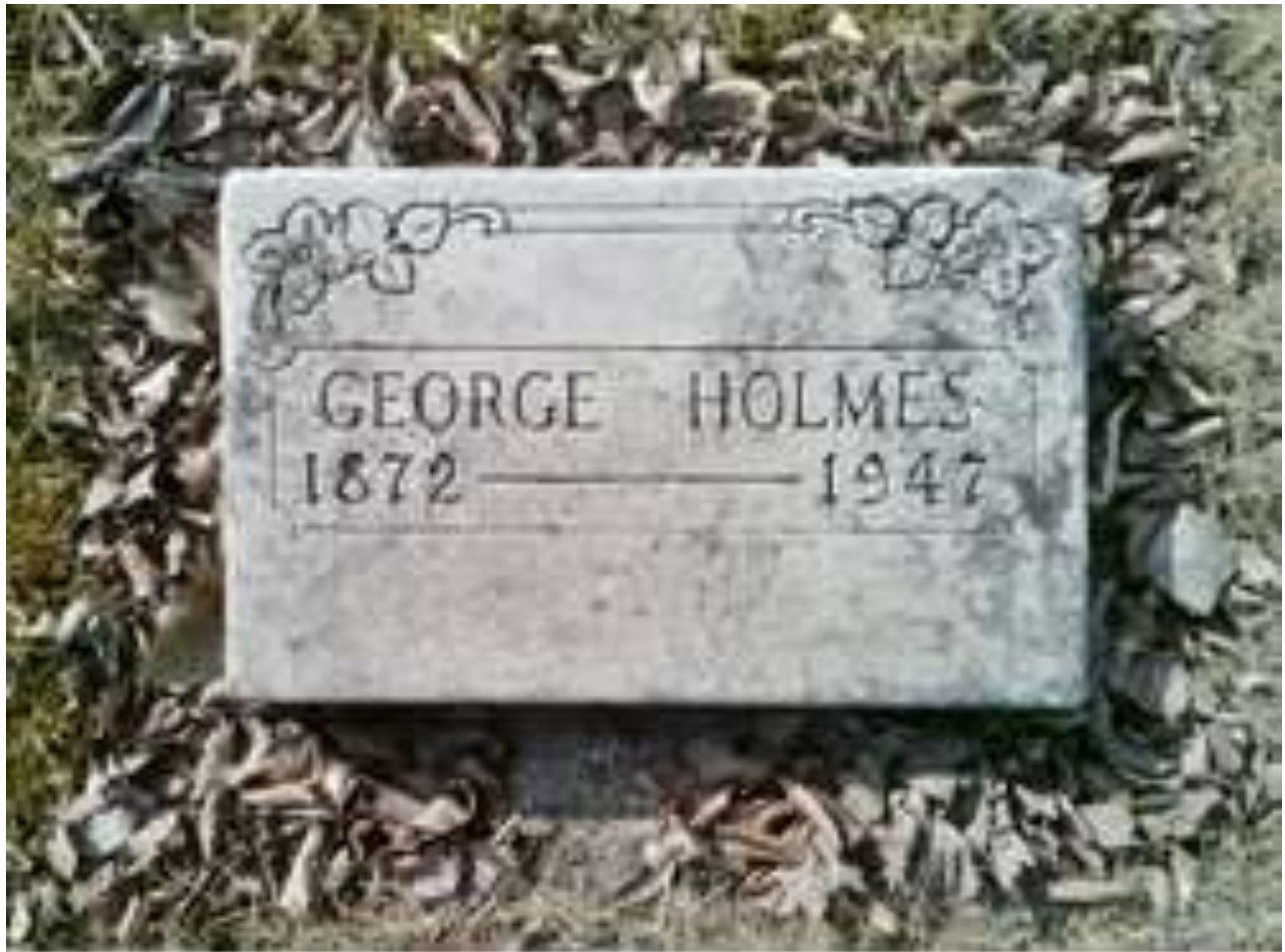
ph658 George Holmes 22-23f. Mount Pleasant Burial Park Swift Current Saskatchewan