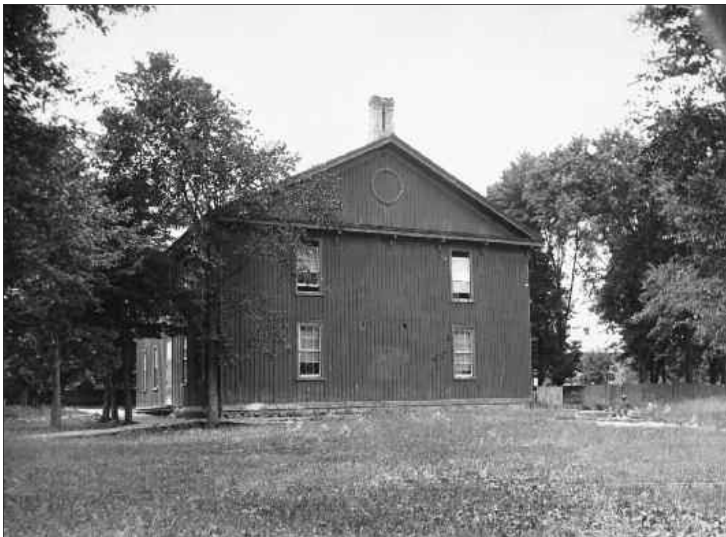
4032 The four-room, red-frame schoolhouse, at the southwest corner of Rowland and St. George streets. It was built in (10) 1866 and housed elementary grades.