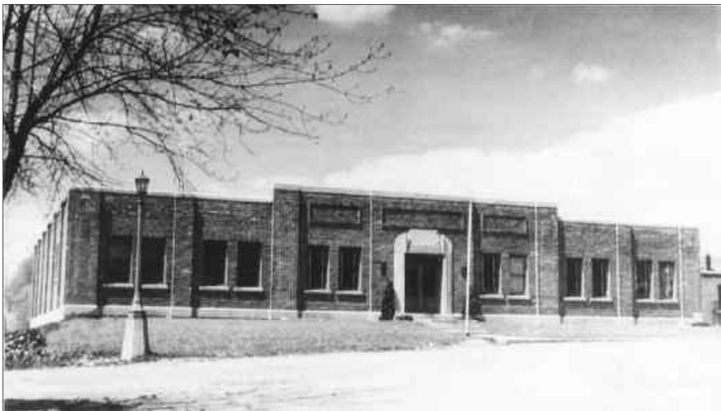
4029 Willow Grove Creamery, at 100 St. George Street, south of Ontario Road, in about 1950. It later was named Stacey Bros.