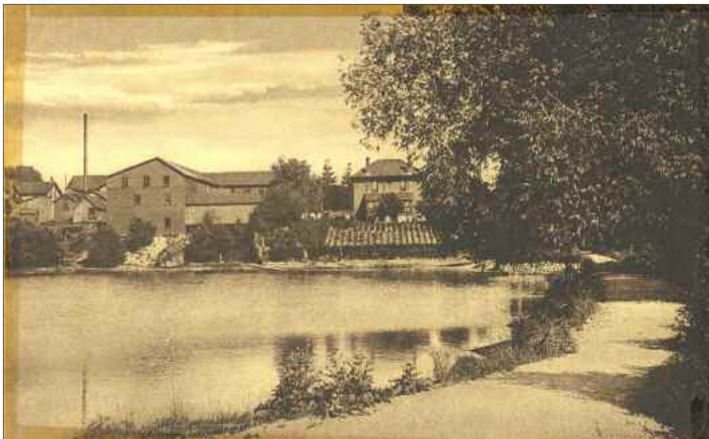
4024 A sepia-coloured view of the walkway heading easterly towards the top of an early dam across the Thames River. The buildings beyond the millpond, on the east side of the river, front onto St. George Street. The large building on the left is the A. Burritt and Co. knitting mill when it was located on St. George Street just north of the intersection with Montreal Street.