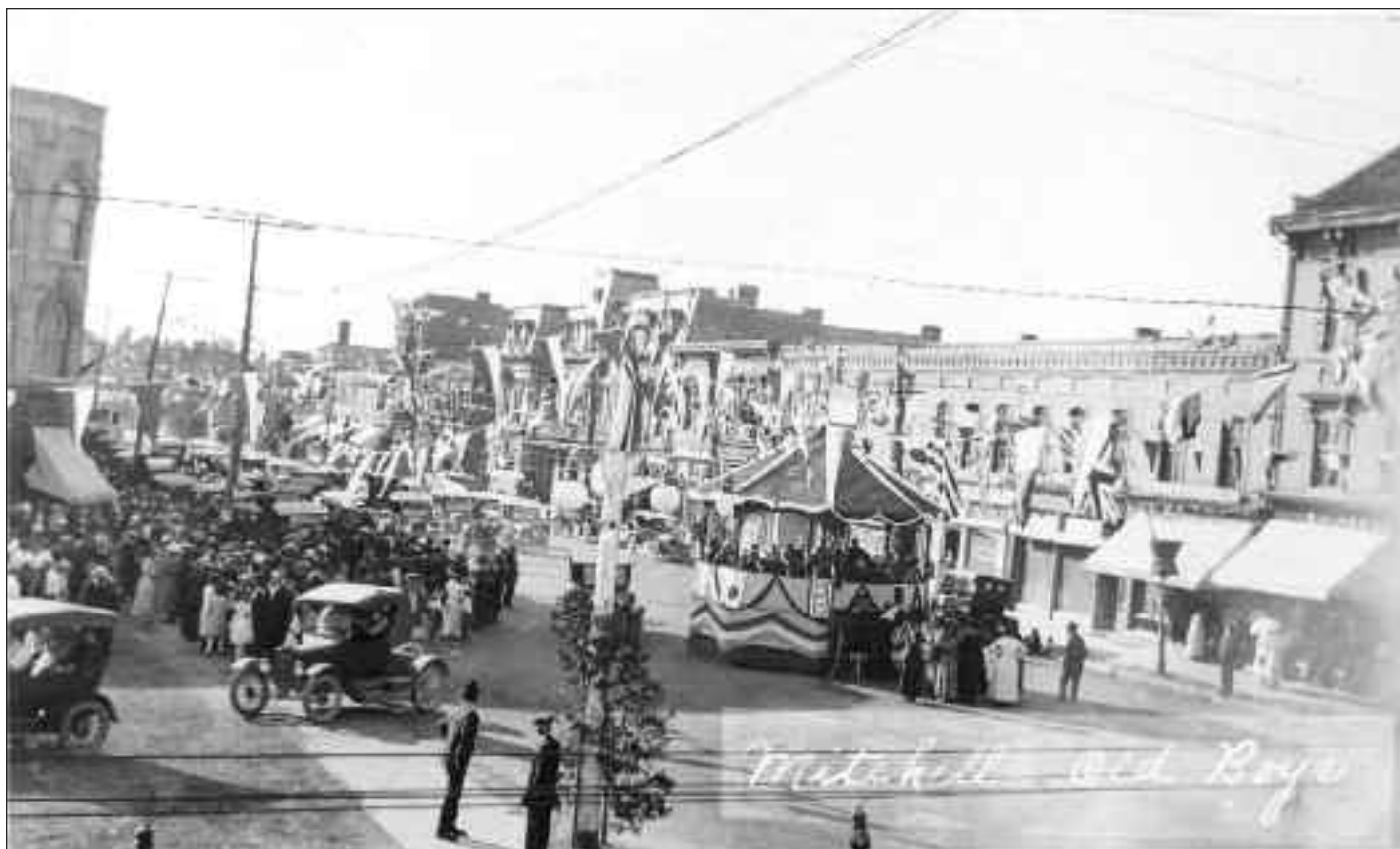
4038 In the summer of 1923 the town of Mitchell held its first old home week, a celebration that lasted eight days. This is a view of the main business block on Ontario Road, looking northwesterly from market square and the intersection of St. Andrew Street. In the middle of Ontario Road is a bandstand.