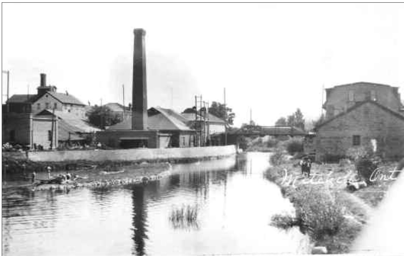
4022 A summer view in the early 1900s of the Thames River, downstream of the dam, looking south toward the steel bridge on Ontario Road. On the left side of the river (east bank) are the powerhouse (large stack) and the Whyte packing company (farther east). On the right (west bank) is the woollen mill.