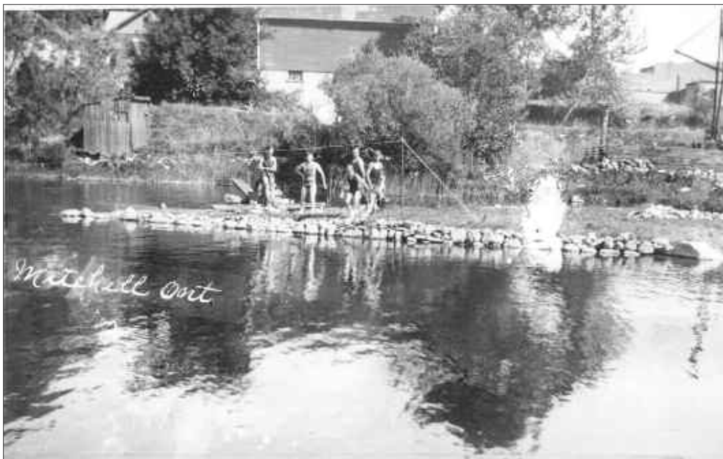
4023 Six youthful swimmers in the early 1900s spend some time swimming in the Thames River, upstream of the dam. To their left is a makeshift diving board.