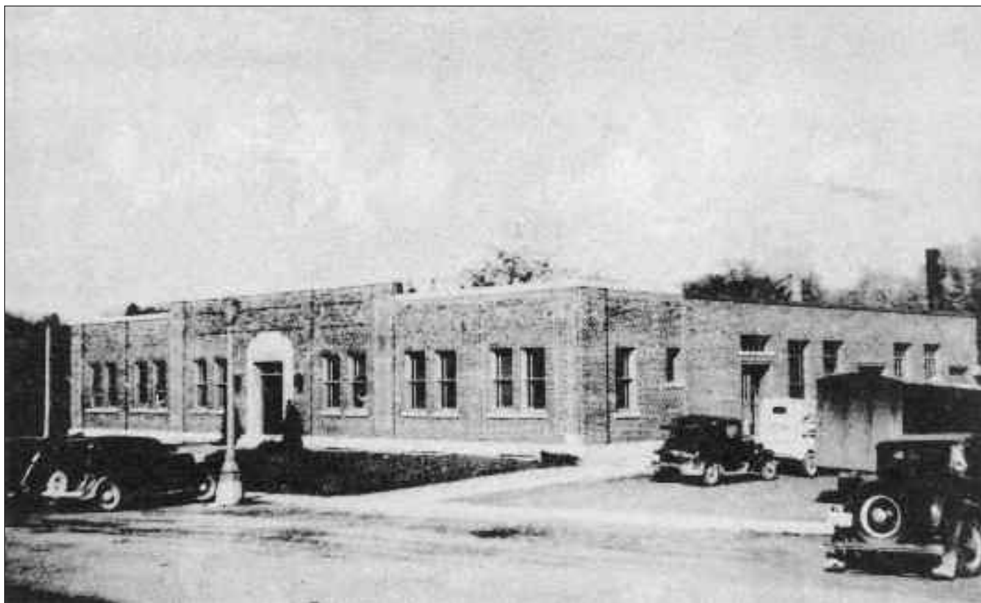
4033 Willow Grove Creamery, not long after it was moved from Willow Grove to 100 St. George Street, south of (8) Ontario Road, in June 1940. It later was named Stacey Bros.