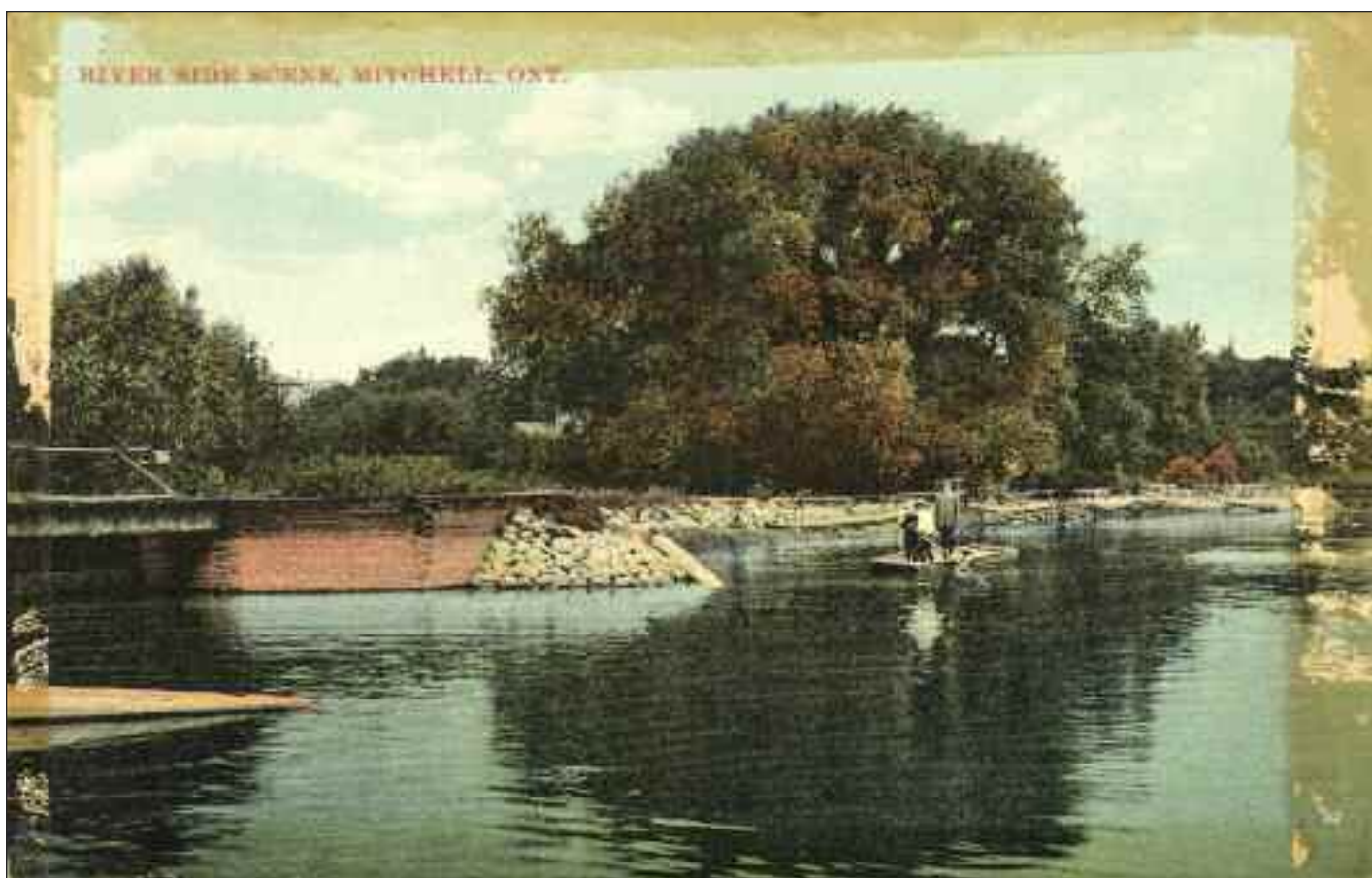
4026 In colour, a westerly view of the Thames River and millpond above the wooden dam. The dam is to the left. In the row boat to the right is a man in what appears to be a military uniform and two youngsters.