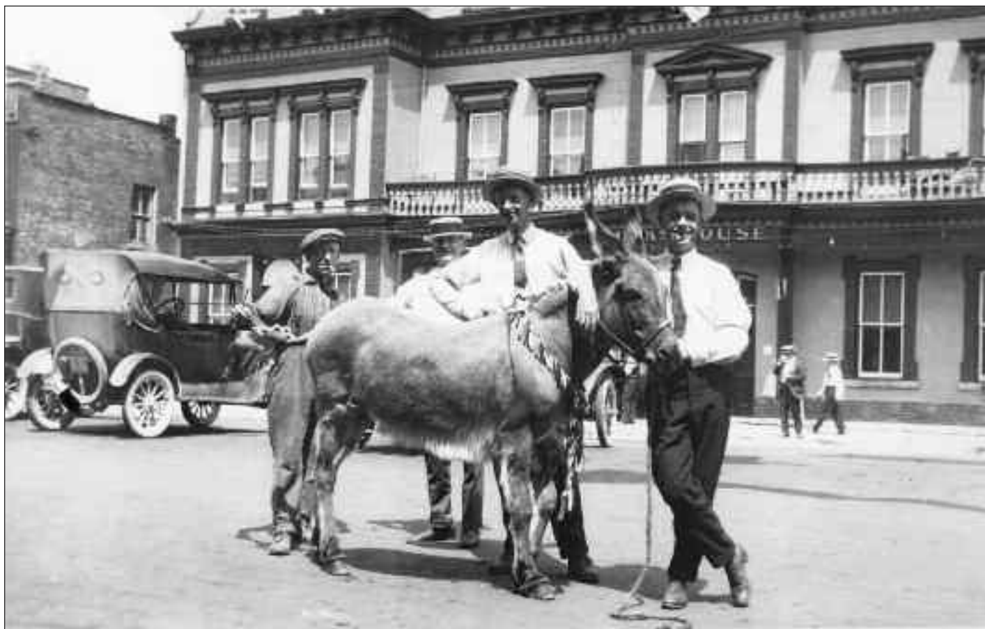
4059 In the summer of 1923 the town of Mitchell held its first old home week, a celebration that lasted eight days. It was a time for man and beast to renew acquaintances. Four of the old boys (three of them in boater hats) share a moment with a donkey in front of the Hicks House.