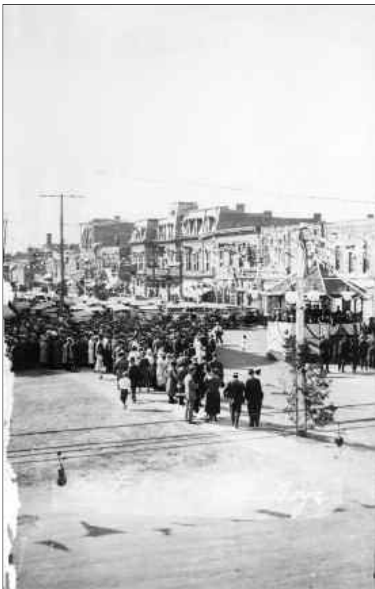
4042 In the summer of 1923 the town of Mitchell held its first old home week, a celebration that lasted eight days. This is a vertical view of the north side of the main business block on Ontario Road, looking northwesterly from market square and the intersection of St. Andrew Street. In the middle of Ontario Road is a bandstand.