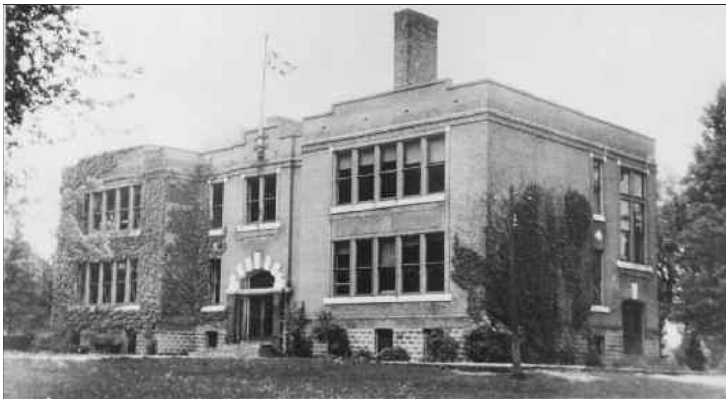
4036 This Mitchell Public School was built at 180 Rowland St. in 1914-15. (9)