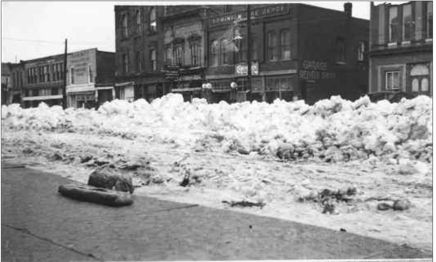
4016 Snow piled high on Ontario Road in 1929. In the background is part of the north half of Mitchell's main business block, between St. Andrew and St. George streets. Identifiable stores, from the left, are the Hewitt furniture and furniture business, a billiards hall, the gas pumps of the Chrysler garage and Dominion Tire Depot, and the beginning of the Hicks House hotel.