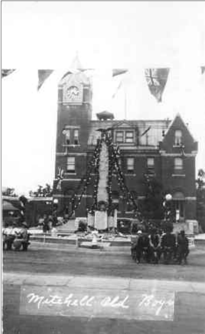
4047 In the summer of 1923 the town of Mitchell held its first old home week, a celebration that lasted eight days. This is a vertical view, looking south, of market square and the decorated cenotaph, and the post office and custom building, adorned with flags.