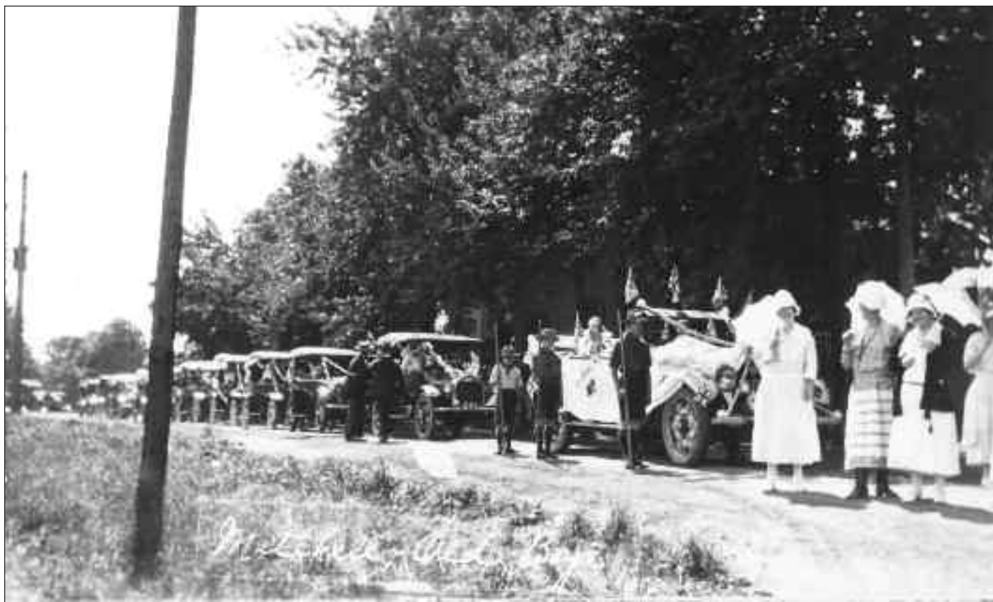
4040 In the summer of 1923 the town of Mitchell held its first old home week, a celebration that lasted eight days. Women with parasols and Boy Scouts with walking sticks are foremost in this photo of cars formed up for a parade.