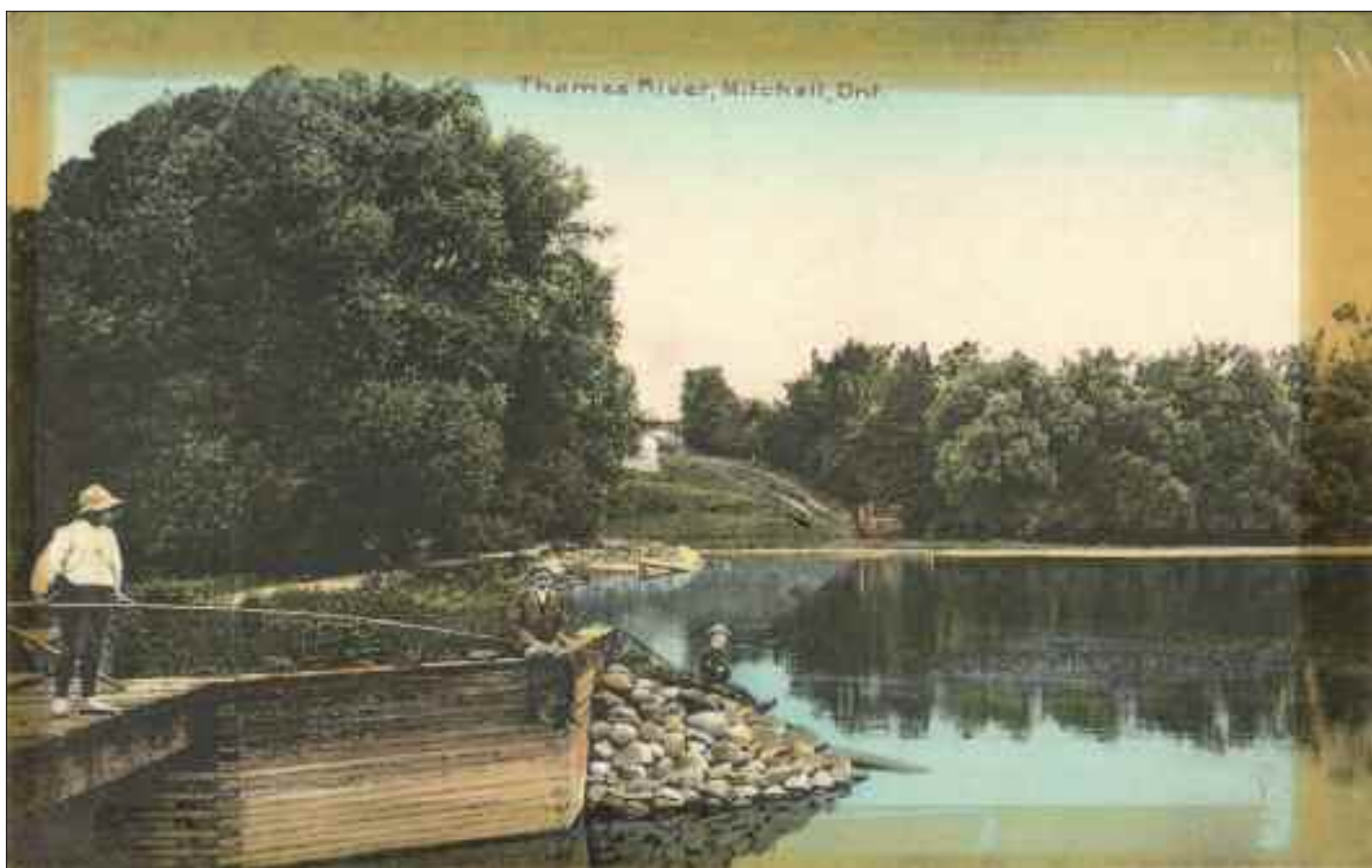
4025 In colour, a westerly view of the Thames River and millpond above the wooden dam. A person standing on the dam appears to be holding a fishing pole. Another person is sitting on the wooden approach to the dam, and a third person on rocks on the adjacent bank.