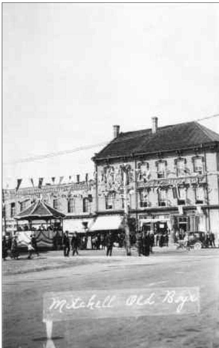
4046 In the summer of 1923 the town of Mitchell held its first old home week, a celebration that lasted eight days. This is a vertical view, looking north, of the intersection of Ontario Road and St. Andrew Street. The dominant building is the Royal Hotel. At left is a bandstand that was in the centre of Ontario Road.