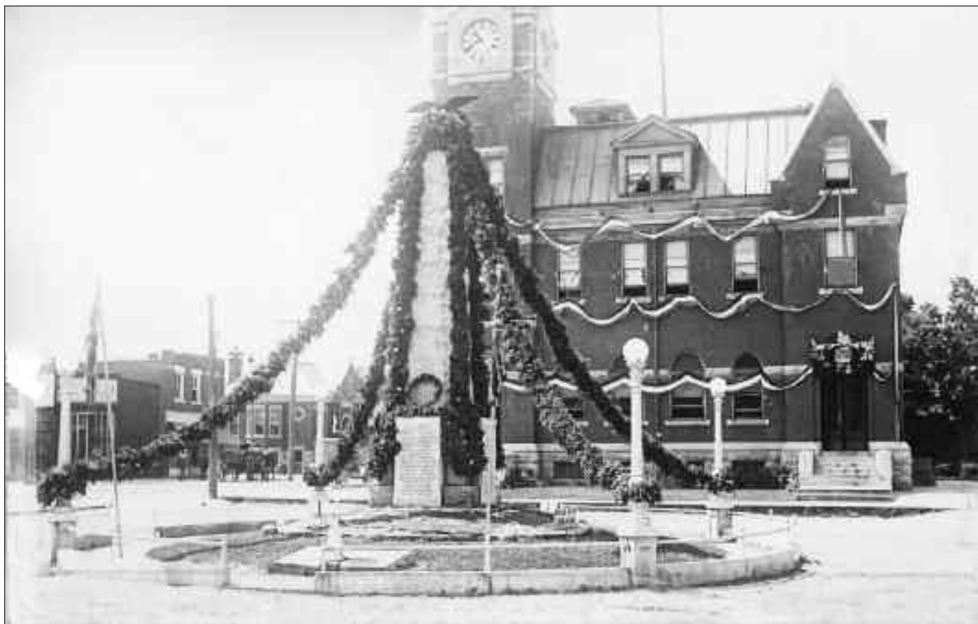
4048 In the summer of 1923 the town of Mitchell held its first old home week, a celebration that lasted eight days. This is a view, looking south, of market square and the decorated cenotaph, and the post office and custom building, adorned with bunting.