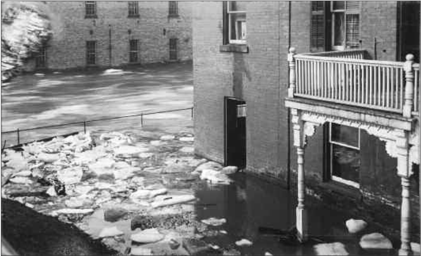
4061 In April 1912, a spring thaw more rapid than usual caused an upstream ice-jam to break through a protective log boom. When the collective mess burst through and over the Mitchell dam, it took out the sluice gates and flooded some buildings downstream, including the woollen mill (left) and powerhouse. This view is from Ontario Road, just east of the river.