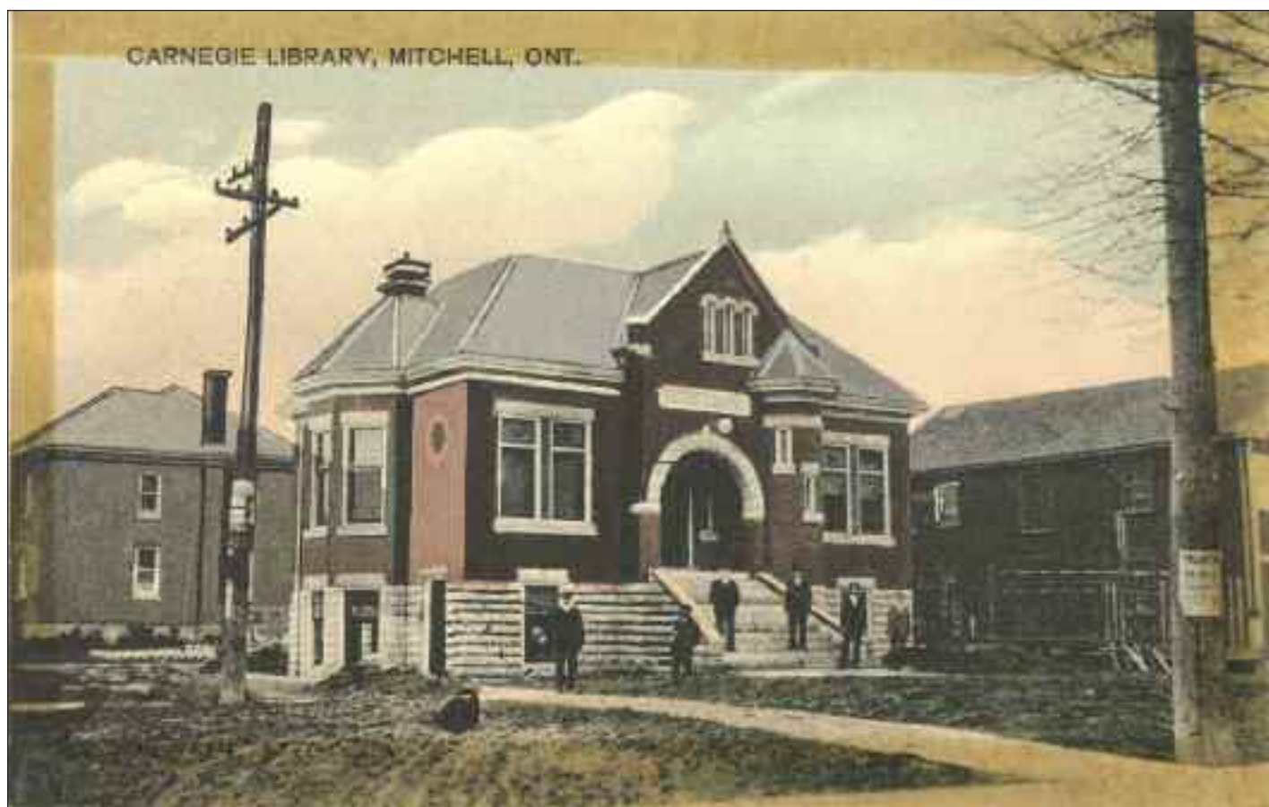
4005 A coloured, southeasterly view of Mitchell's Carnegie Library, soon after it was built in 1910, on the southeast corner of the intersection of Quebec and St. Andrew streets. The six people in the photo are unidentified.