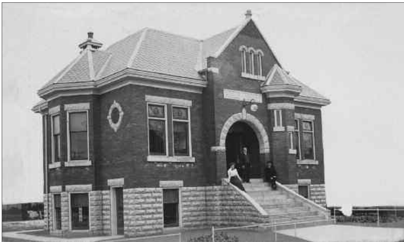
4006 A southeasterly view of Mitchell's Carnegie Library, on the southeast corner of the intersection of Quebec and St. Andrew streets. On the front steps are three people, one of whom appears to be a member of the clergy. The three people on the front steps are unidentified. Enclosing the library grounds is a decorative, metal railing-type fence. At the time this postcard was printed, it required a one-cent stamp for mailing.